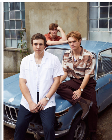
FACING FORWARD WITH TORS